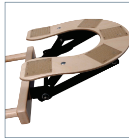
UP DPOS-B - Upgrade from Dual Action Face Rest Base to Deluxe Adjustable. Full range of adjustment is 4-6".