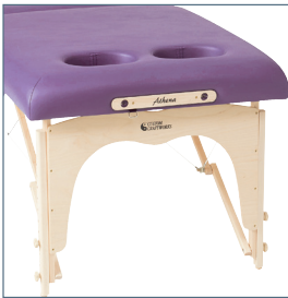
BR - Breast Recesses Option - Breast/Scapula Recesses include dual cutouts with central sternum/spine support (includes custom plugs)