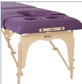
PG - Prenatal Option - Breast Recesses and belly cutout with adjustable sling to provide comfort and support to expectant mothers of any size (includes custom plugs)