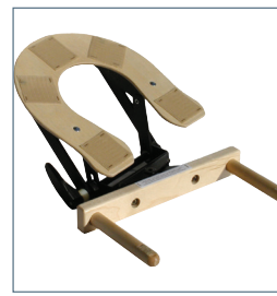
UP PPOS-B - Upgrade from Dual Action Face Rest Base to Pivot Posi-tilt. Full range of adjustment is 4-6" and pivots 30° in either direction.